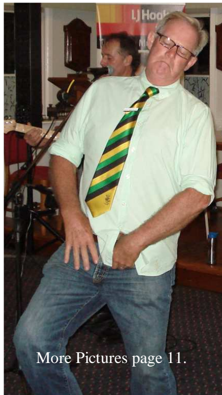
More Pictures page 11.