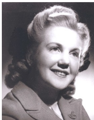
NOW AT PEACE.