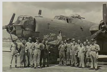
B24 Liberator and Crew Townville