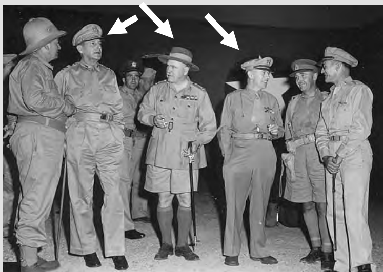
Port Moresby 1942, Gen. MacArthur, Gen. Thomas Blamey and Gen. Kenney

was relieved of this command in 1948 as he had become too political. He retired from the air force and became a cab driver in Washington!!