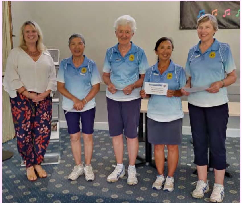
ANOTHER TRIUMPH Seaforth 2021 Autumn Carnival 26 February OVERALL WINNING TEAM