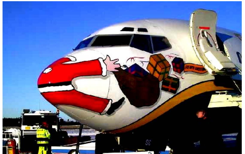
I've gotta cut back on the caffeine