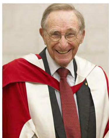
Always smiling, always affable.