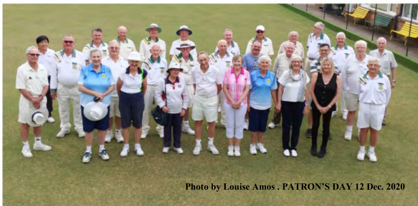
PATRON'S DAY 12 Dec. 2020